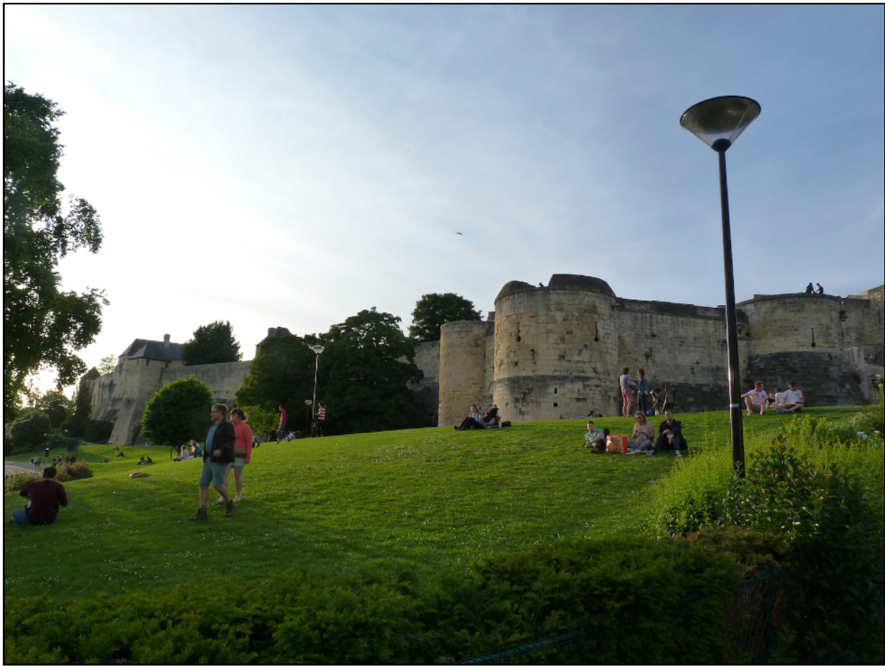
The ruins of a Norman castle in Caen.