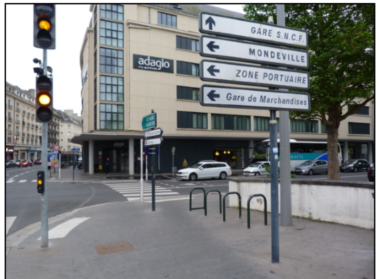
The Adagio Hotel.