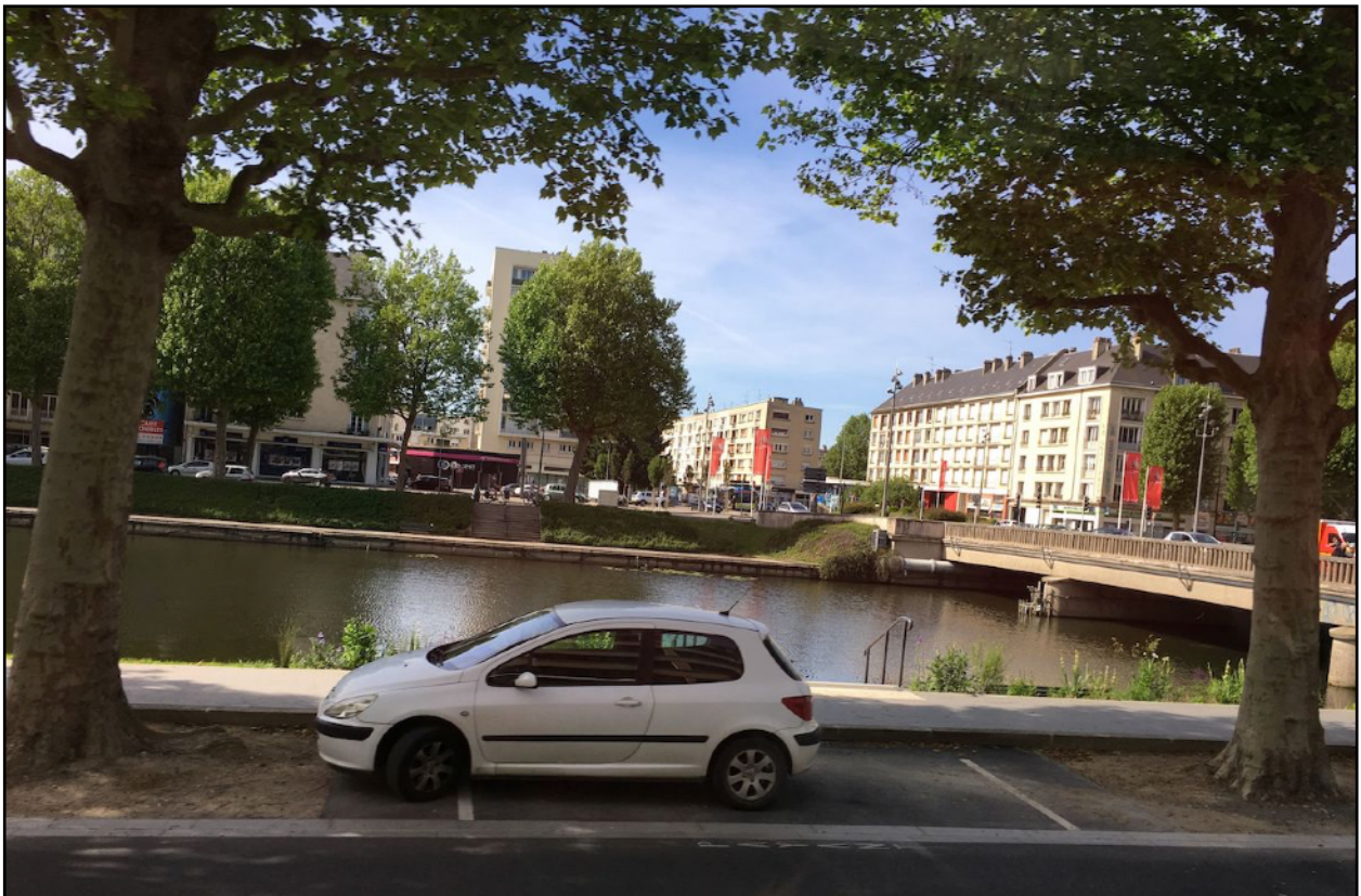
The Orne River near our hotel.