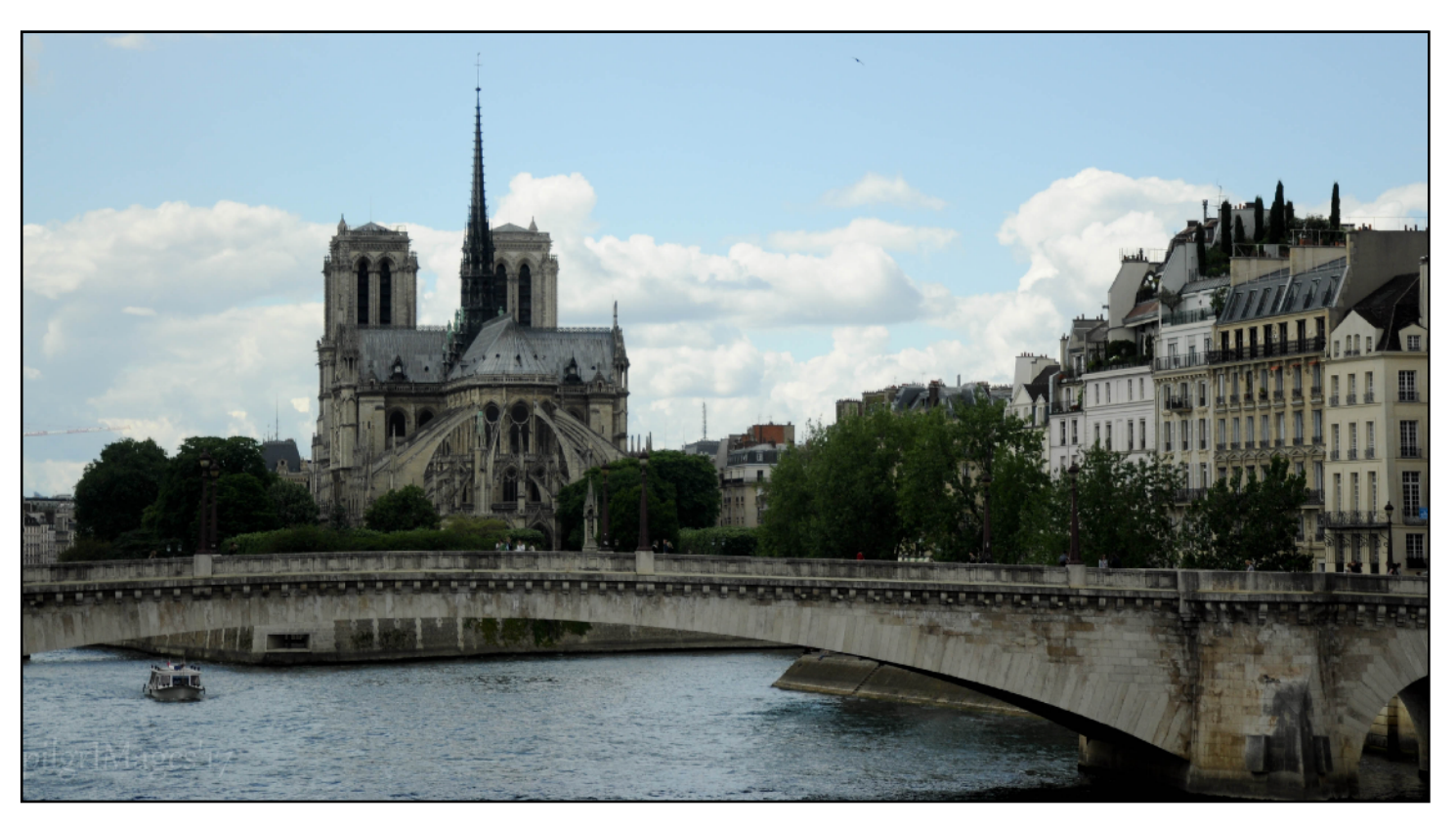
By Sheila Pilgrim.