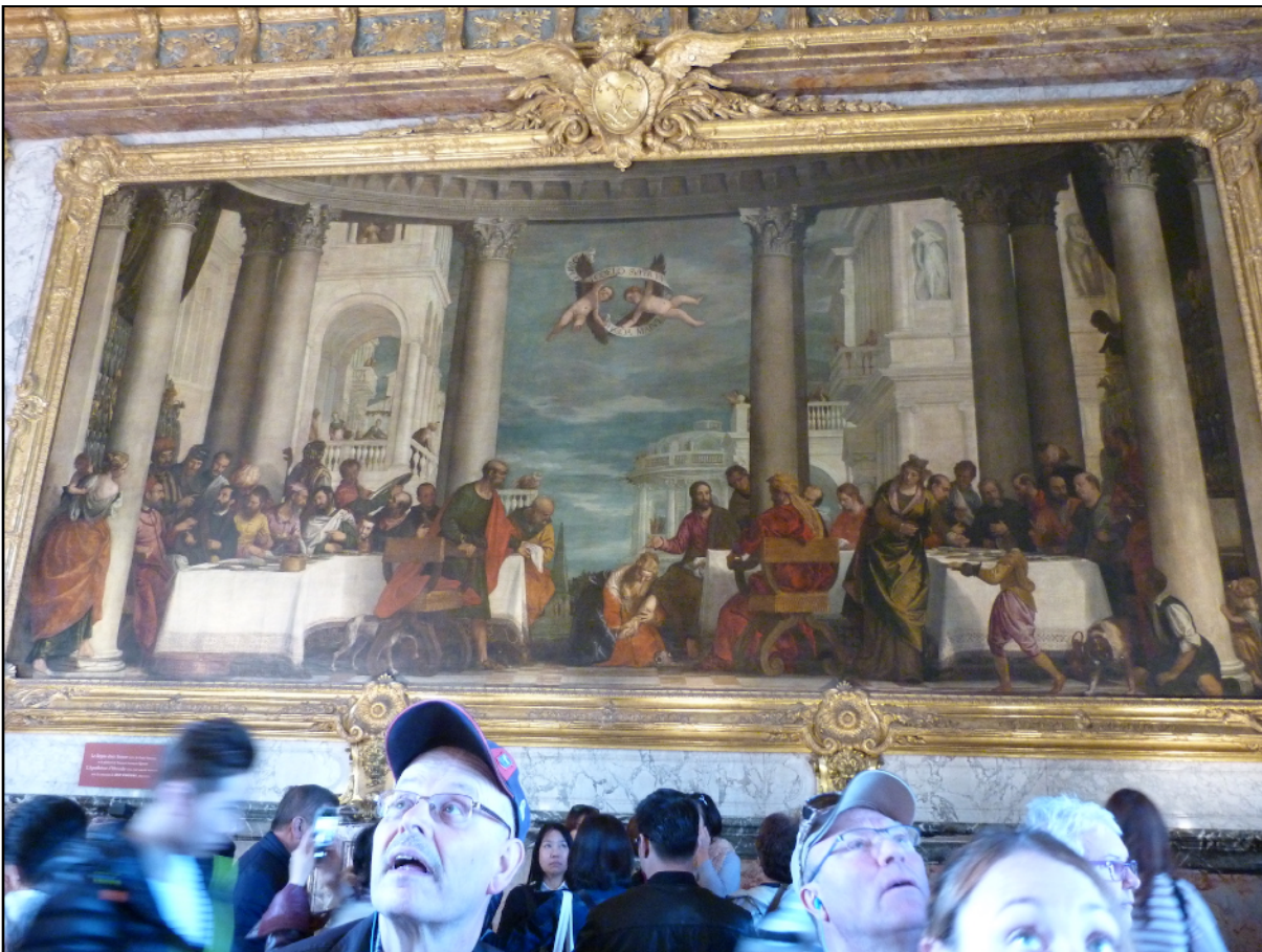
Left