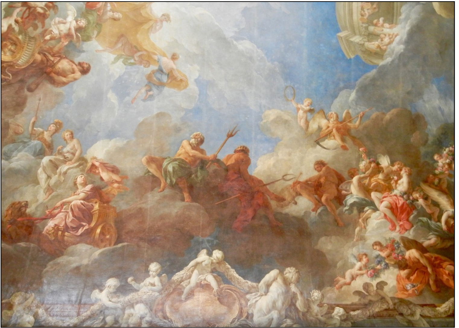
Above