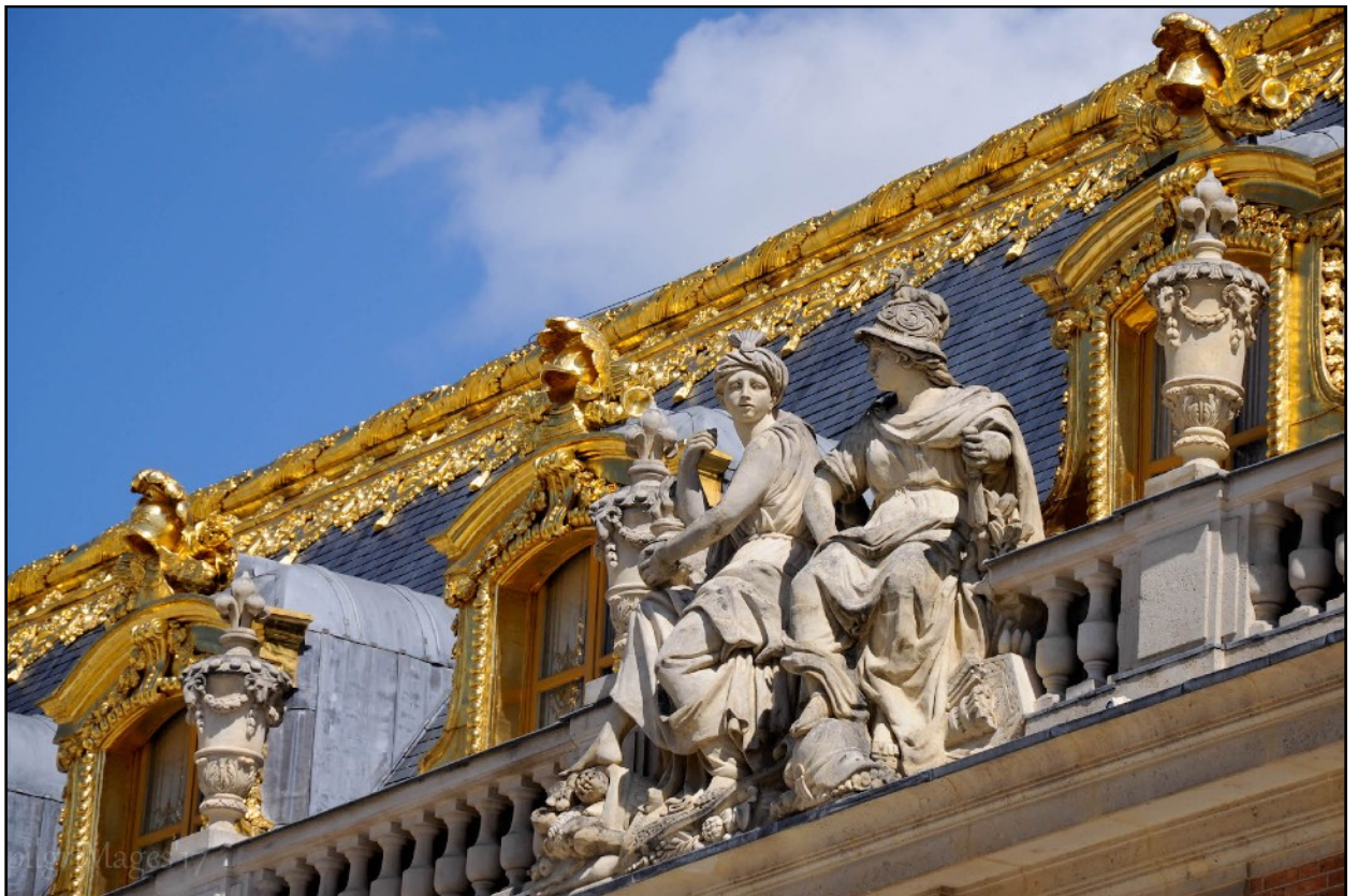
Right: By Sheila Pilgrim.