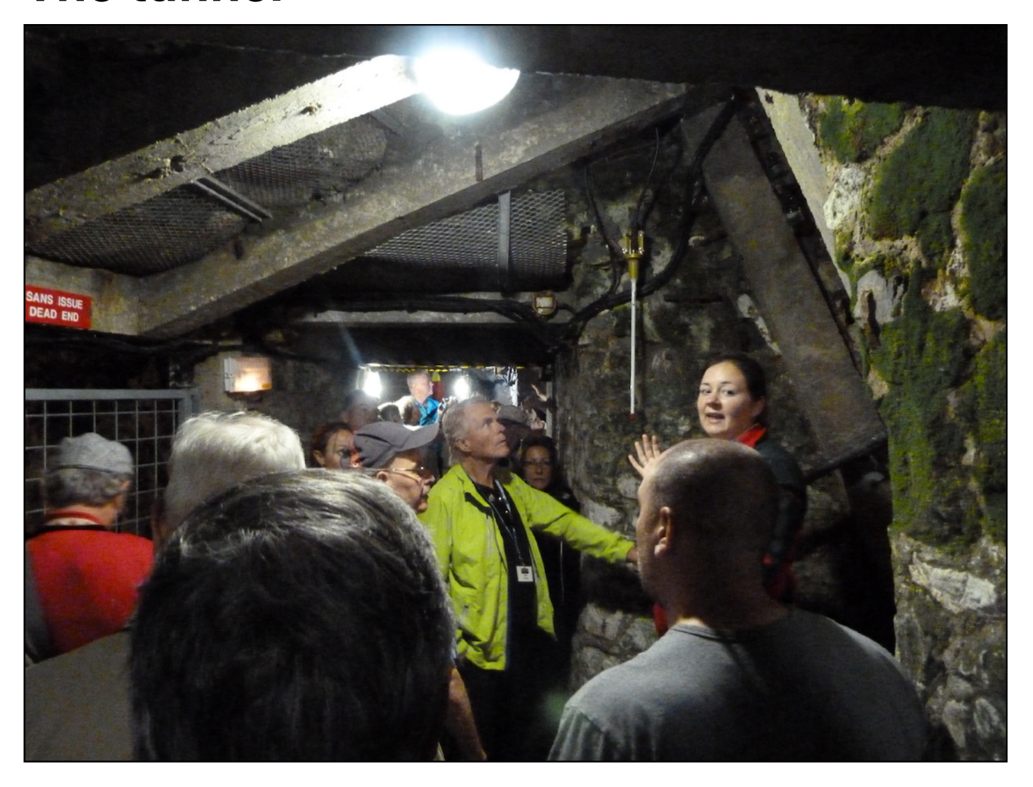
Our guide shows tunnels where Canadians waited in silence for hours before launching their attack.