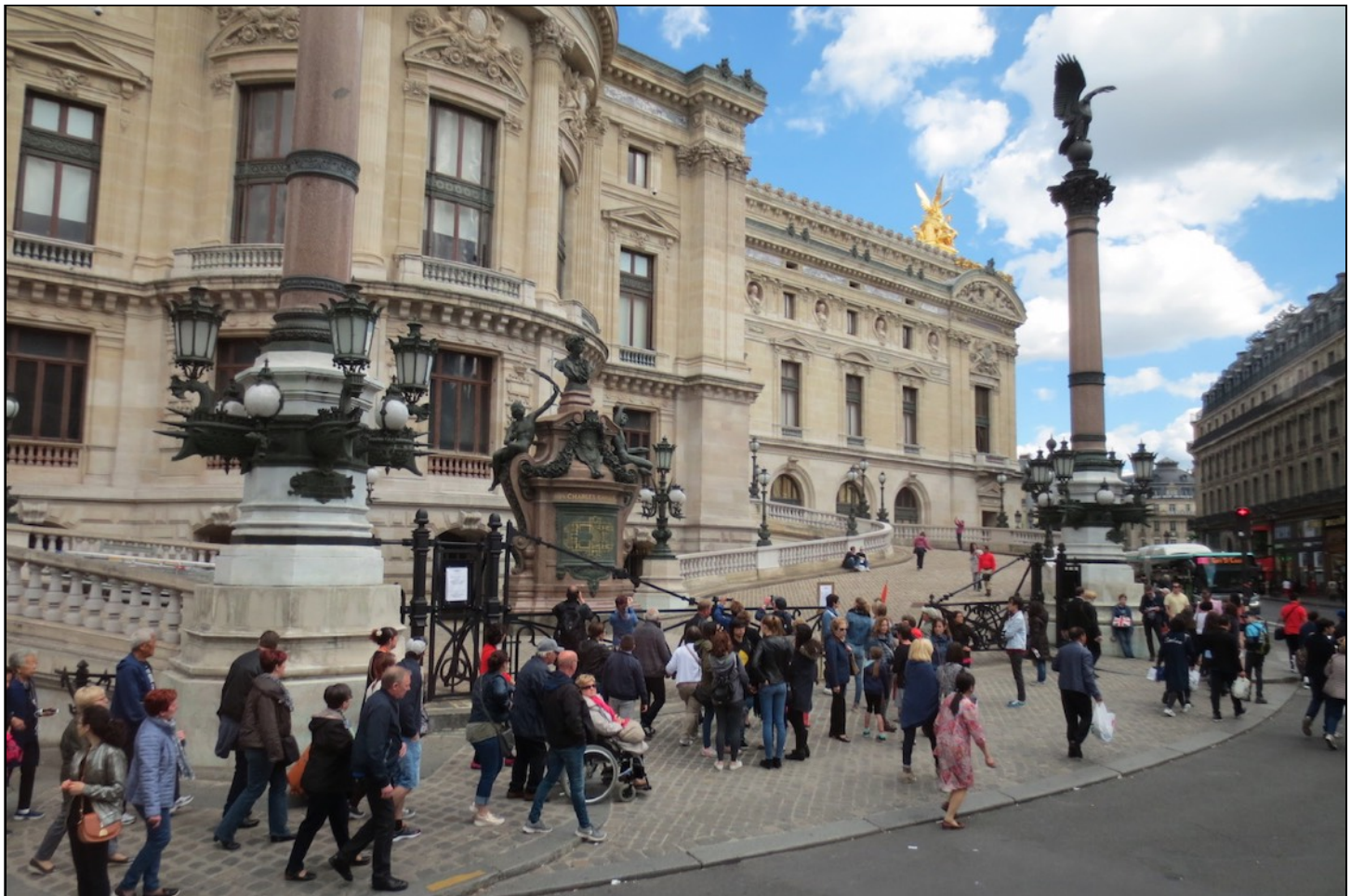
The Opera of Phantom fame.