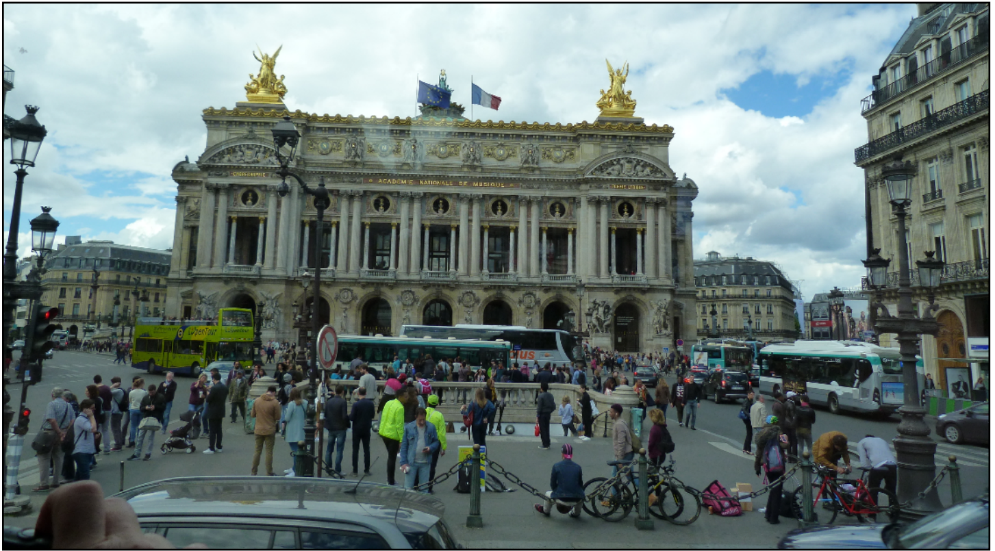
National Academy of Music.