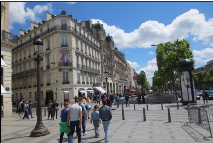
The Champs Élysées.