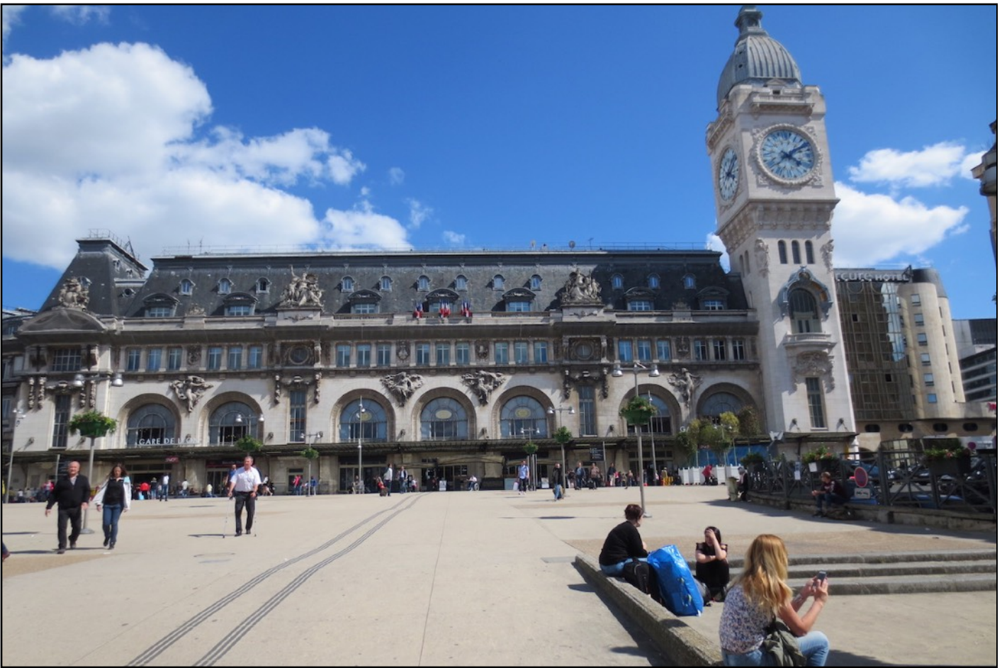
Mercure hotel is to the right of the Gare de Lyon train station.