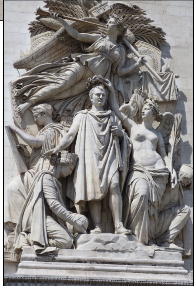
Top and above: The Arc de Triomphe.