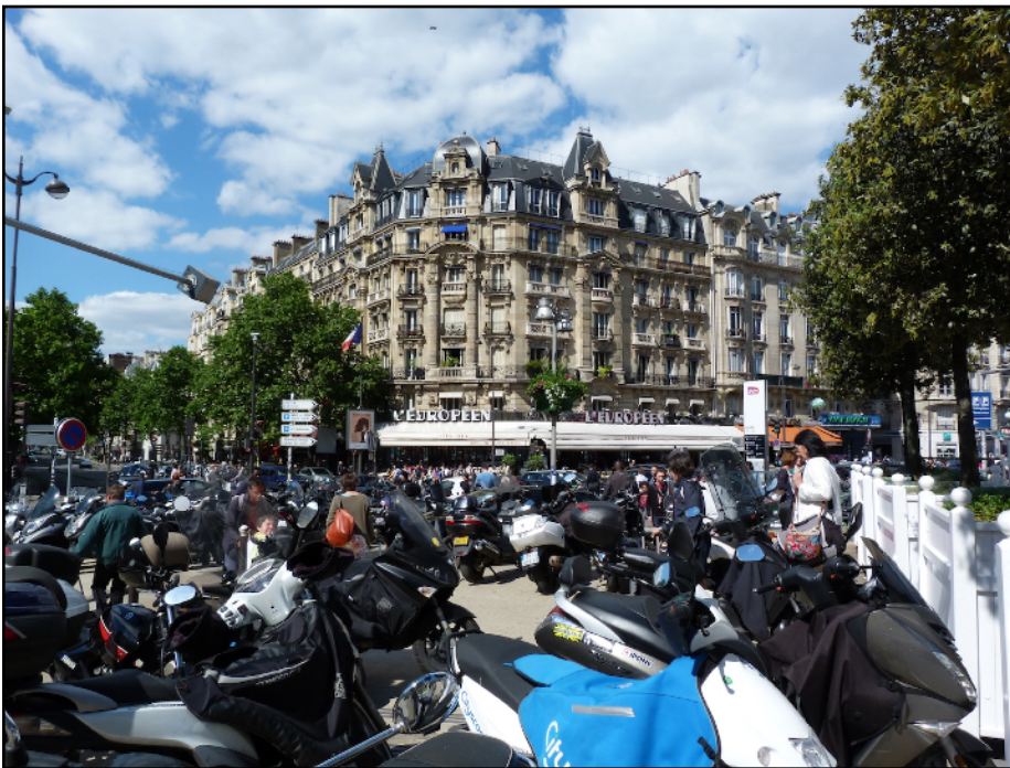
Motorcycles parked in front of train station. By Robert Judd